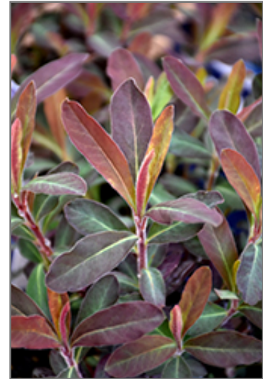
Purple Wood Spurge foliage

Purple Wood Spurge is a fine choice for the garden, but it is also a good selection for planting in outdoor pots and containers. It is often used as a 'filler' in the 'spiller-thriller-filler' container combination, providing a mass of flowers and foliage against which the thriller plants stand out. Note that when growing plants in outdoor containers and baskets, they may require more frequent waterings than they would in the yard or garden.