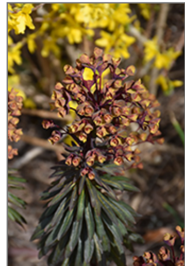
Purple Wood Spurge flower buds