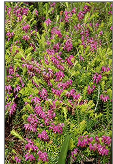
Myretoun Ruby Heath flowers