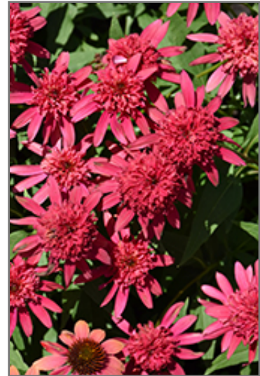
Double Scoop Raspberry Coneflower flowers