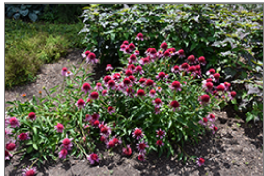
Double Scoop Bubble Gum Coneflower in bloom