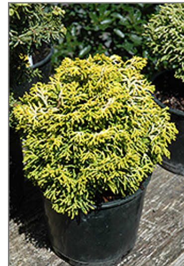
Butterball Hinoki Falsecypress