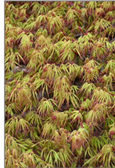
Spring Delight Japanese Maple foliage