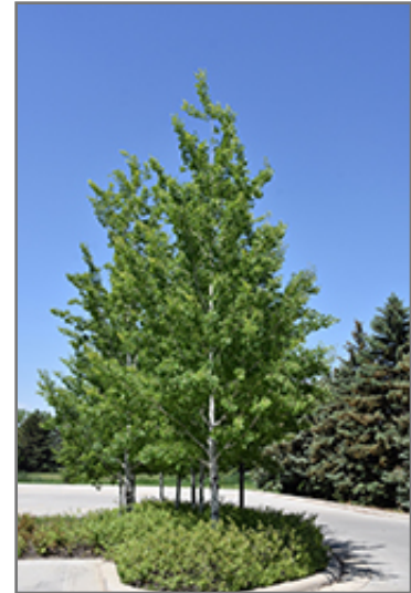
Prairie Gold Trembling Aspen