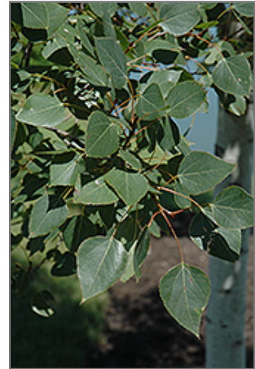
Prairie Gold Trembling Aspen foliage

This tree should only be grown in full sunlight. It is an amazingly adaptable plant, tolerating both dry conditions and even some standing water. It is considered to be drought-tolerant, and thus makes an ideal choice for xeriscaping or the moisture-conserving landscape. It is not particular as to soil type or pH. It is somewhat tolerant of urban pollution. This is a selection of a native North American species.