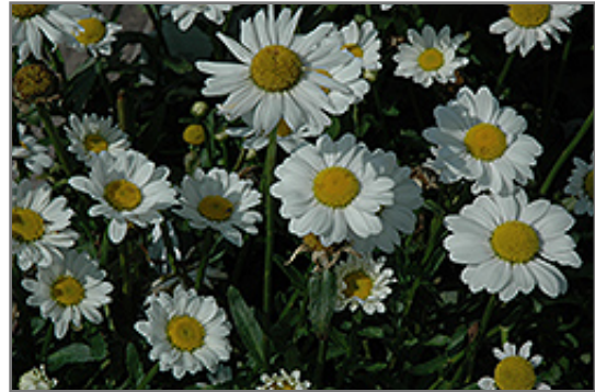
May Queen Shasta Daisy flowers