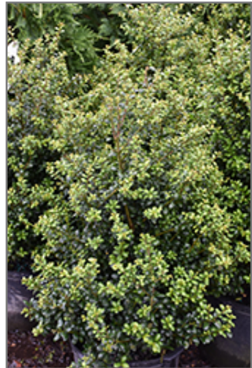
Chesapeake Japanese Holly