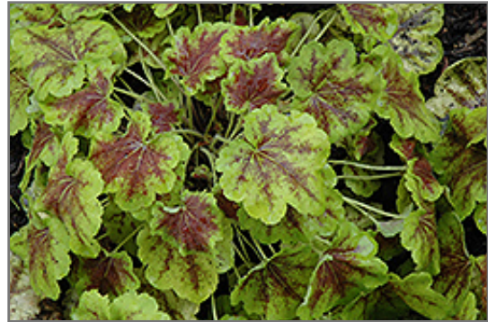
Solar Eclipse Foamy Bells foliage

Solar Eclipse Foamy Bells is recommended for the following landscape applications;