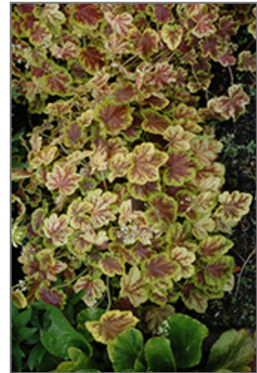
Solar Eclipse Foamy Bells