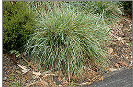
Blue Moor Grass