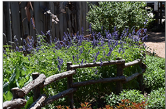
Mealy Cup Sage in bloom