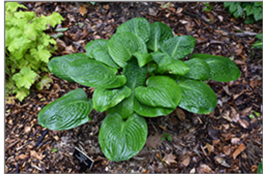
Potomac Pride Hosta