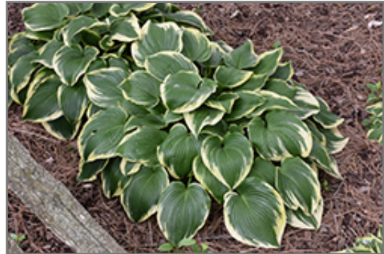
Memories of Dorothy Hosta