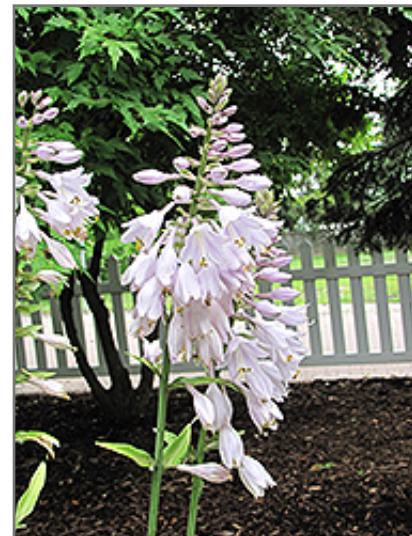
Key West Hosta flowers