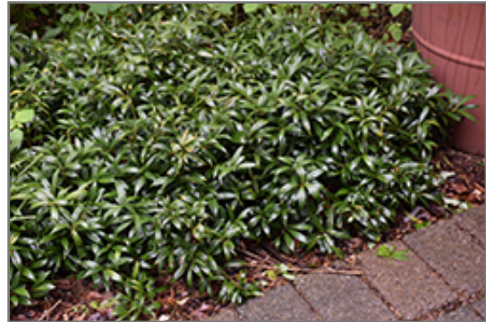
Himalayan Sweet Box

Himalayan Sweet Box is recommended for the following landscape applications;