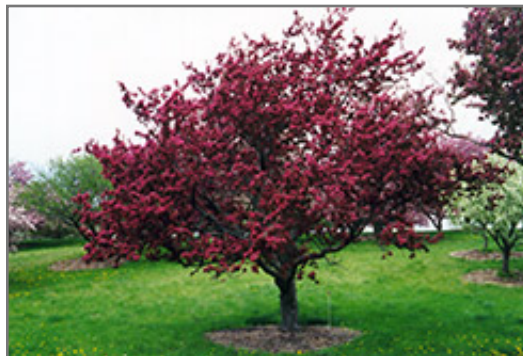
Profusion Flowering Crab in bloom