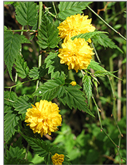
Double Flowered Japanese Kerria flowers