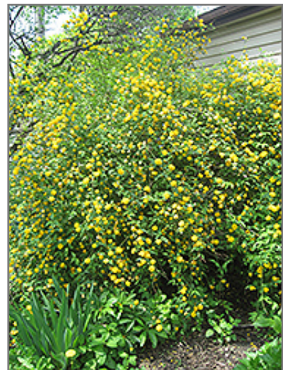
Double Flowered Japanese Kerria