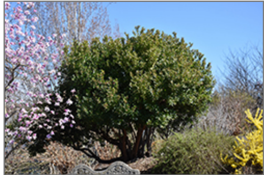
Strawberry Tree