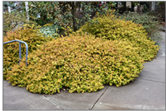
Kaleidoscope Abelia

Kaleidoscope Abelia will grow to be about 30 inches tall at maturity, with a spread of 4 feet. It tends to fill out right to the ground and therefore doesn't necessarily require facer plants in front. It grows at a slow rate, and under ideal conditions can be expected to live for approximately 30 years.