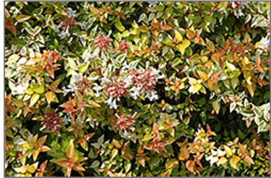
Kaleidoscope Abelia flowers

This shrub will require occasional maintenance and upkeep, and should only be pruned after flowering to avoid removing any of the current season's flowers. It is a good choice for attracting birds, bees and butterflies to your yard, but is not particularly attractive to deer who tend to leave it alone in favor of tastier treats. It has no significant negative characteristics.