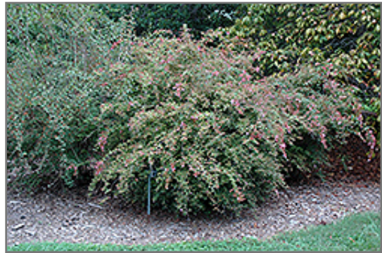
Edward Goucher Abelia in bloom