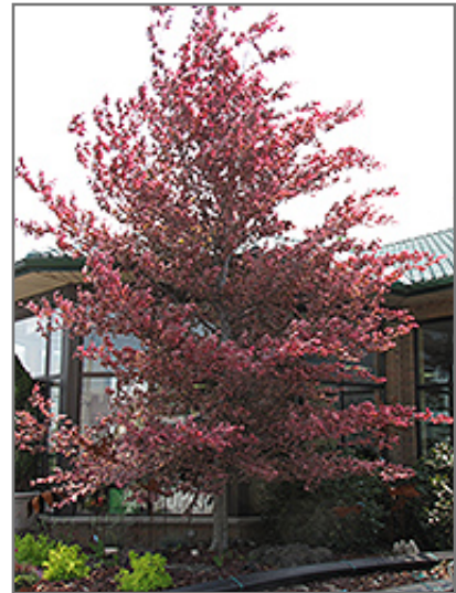
Tricolor Beech