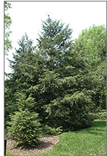
Canadian Hemlock