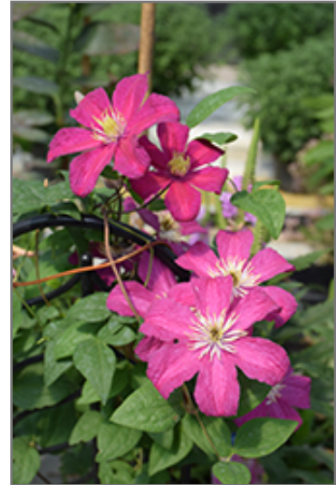
Barbara Harrington Clematis flowers