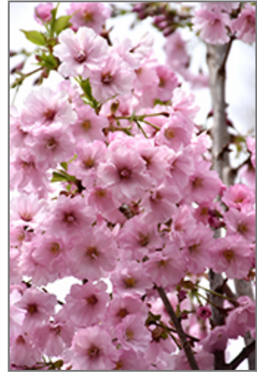
First Blush Flowering Cherry flowers