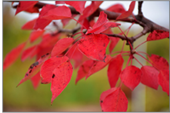
New Bradford Ornamental Pear in fall

* This is a 'special order' plant - contact store for details