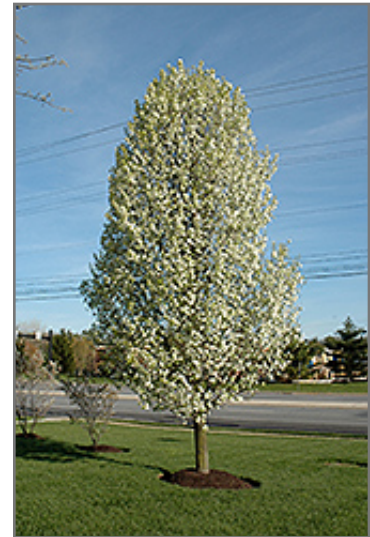
New Bradford Ornamental Pear in bloom