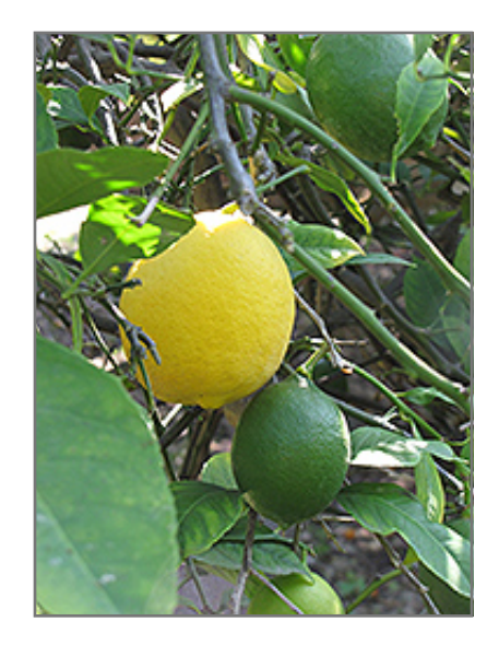
Improved Meyer Lemon fruit