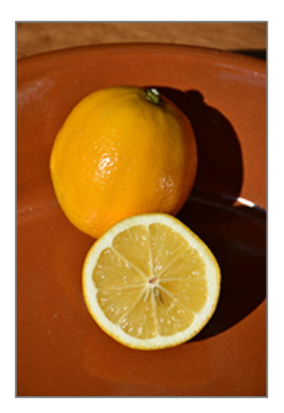
Improved Meyer Lemon fruit

Improved Meyer Lemon features showy clusters of fragrant white star-shaped flowers with buttery yellow eyes at the ends of the branches from early spring to late winter. It has attractive dark green evergreen foliage. The glossy oval leaves are highly ornamental and remain dark green throughout the winter. It features an abundance of magnificent yellow berries from early spring to late winter.