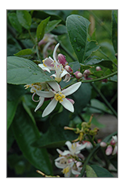
Improved Meyer Lemon flowers

This plant is typically grown in a designated edibles garden. It does best in full sun to partial shade. It prefers to grow in average to moist conditions, and shouldn't be allowed to dry out. It is not particular as to soil type or pH. It is somewhat tolerant of urban pollution. This particular variety is an interspecific hybrid.