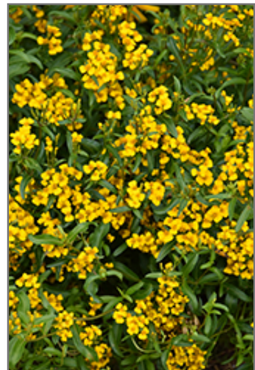
Mexican Tarragon flowers

Mexican Tarragon features showy yellow daisy flowers with gold eyes at the ends of the stems from late summer to early fall. Its attractive fragrant narrow compound leaves remain green in color throughout the season.