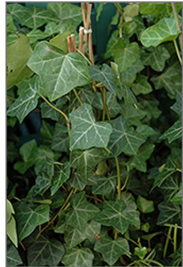
Thorndale Ivy foliage