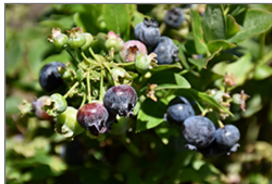
Jelly Bean Blueberry fruit