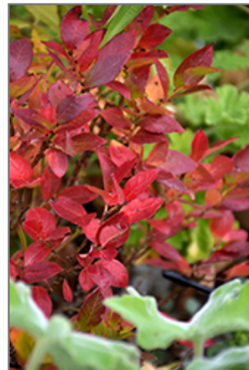
Jelly Bean Blueberry in fall

Jelly Bean Blueberry features dainty clusters of white bell-shaped flowers with shell pink overtones hanging below the branches in mid spring. It has red-variegated green foliage. The glossy oval leaves turn an outstanding red in the fall. It features an abundance of magnificent blue berries in mid summer.