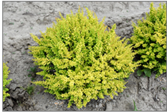
Sunsation Japanese Barberry

Sunsation Japanese Barberry is recommended for the following landscape applications;