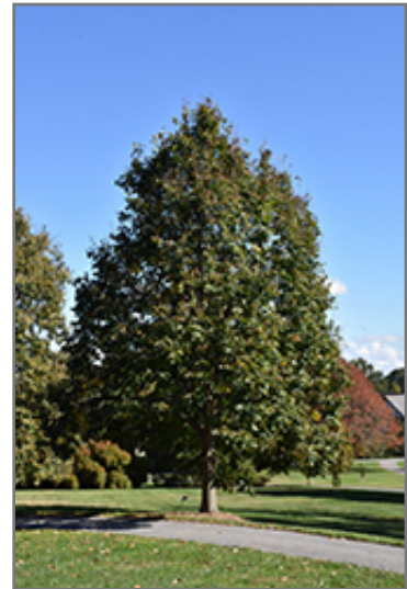
Redmond Linden