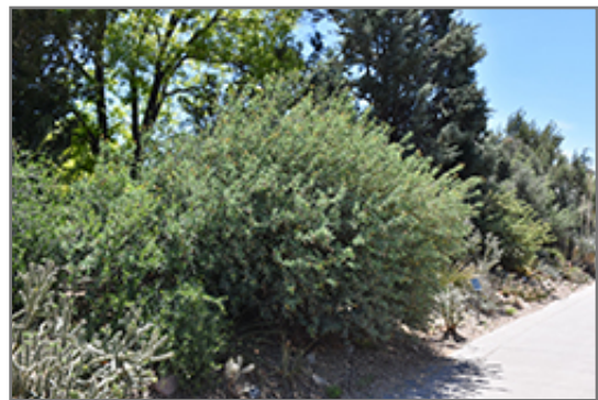
Fremont Mahonia in bloom