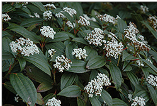
David Viburnum flowers