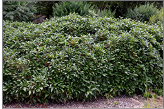
David Viburnum

David Viburnum will grow to be about 4 feet tall at maturity, with a spread of 4 feet. It tends to fill out right to the ground and therefore doesn't necessarily require facer plants in front. It grows at a medium rate, and under ideal conditions can be expected to live for 40 years or more. This is a female variety of the species which requires a male selection of the same species growing nearby in order to set fruit.