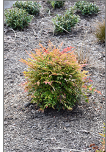
Gulf Stream Dwarf Nandina