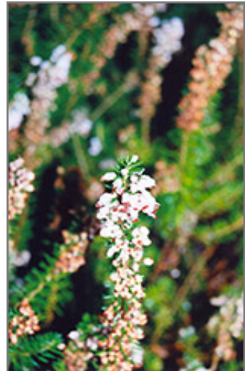
Scotch Heather flowers