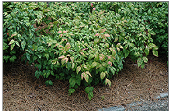
Fire Power Nandina