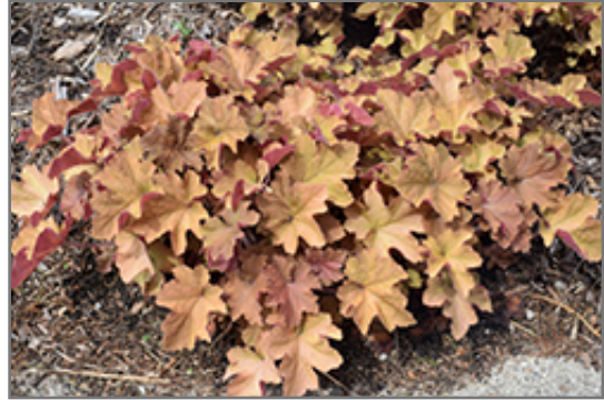
Caramel Coral Bells

Caramel Coral Bells will grow to be about 10 inches tall at maturity extending to 18 inches tall with the flowers, with a spread of 18 inches. When grown in masses or used as a bedding plant, individual plants should be spaced approximately 15 inches apart. Its foliage tends to remain low and dense right to the ground. It grows at a medium rate, and under ideal conditions can be expected to live for approximately 10 years. As an evergreen perennial, this plant will typically keep its form and foliage year-round.