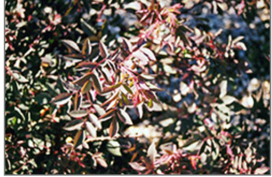
Red Leaf Rose foliage

This shrub should only be grown in full sunlight. It does best in average to evenly moist conditions, but will not tolerate standing water. It is not particular as to soil type or pH. It is highly tolerant of urban pollution and will even thrive in inner city environments. This species is not originally from North America.