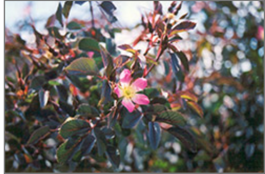
Red Leaf Rose flowers