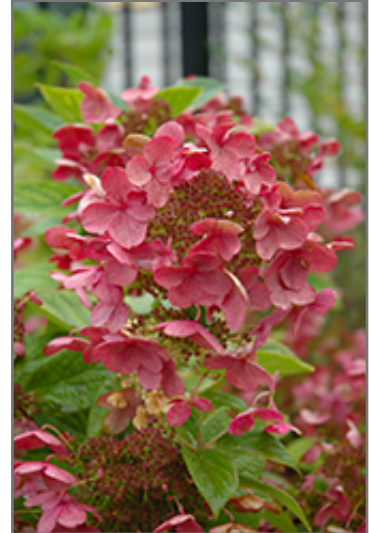
Quick Fire Hydrangea flowers (faded)

This shrub performs well in both full sun and full shade. It prefers to grow in average to moist conditions, and shouldn't be allowed to dry out. It is not particular as to soil type or pH. It is highly tolerant of urban pollution and will even thrive in inner city environments. Consider applying a thick mulch around the root zone in winter to protect it in exposed locations or colder microclimates. This is a selected variety of a species not originally from North America.