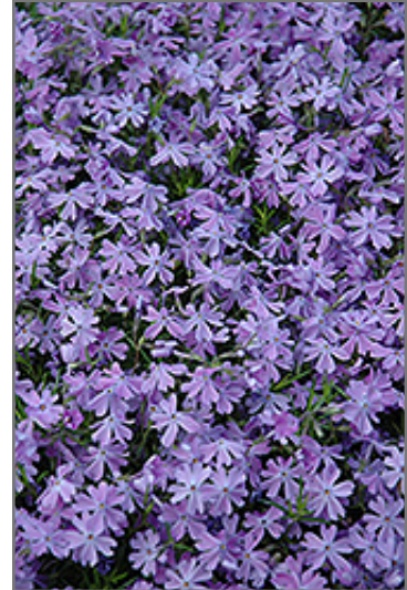
Emerald Blue Moss Phlox flowers