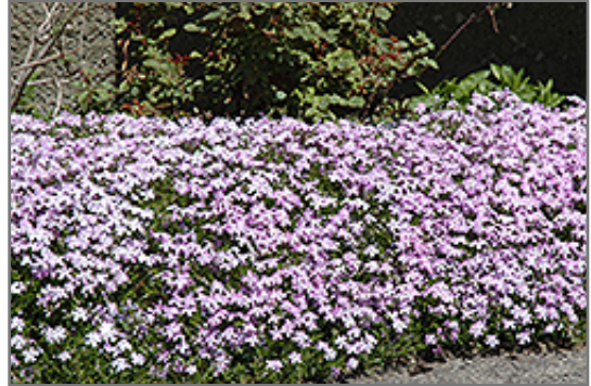
Emerald Blue Moss Phlox in bloom

This plant does best in full sun to partial shade. It prefers dry to average moisture levels with very well-drained soil, and will often die in standing water. It is considered to be drought-tolerant, and thus makes an ideal choice for a low-water garden or xeriscape application. It is not particular as to soil type, but has a definite preference for alkaline soils. It is highly tolerant of urban pollution and will even thrive in inner city environments. Consider covering it with a thick layer of mulch in winter to protect it in exposed locations or colder microclimates. This is a selection of a native North American species. It can be propagated by division; however, as a cultivated variety, be aware that it may be subject to certain restrictions or prohibitions on propagation.