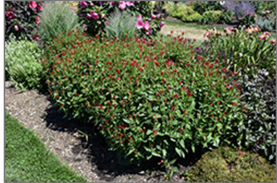
Little Redhead Indian Pink in bloom

Little Redhead Indian Pink will grow to be about 20 inches tall at maturity, with a spread of 24 inches. When grown in masses or used as a bedding plant, individual plants should be spaced approximately 20 inches apart. Its foliage tends to remain dense right to the ground, not requiring facer plants in front. It grows at a fast rate, and under ideal conditions can be expected to live for approximately 5 years. As an herbaceous perennial, this plant will usually die back to the crown each winter, and will regrow from the base each spring. Be careful not to disturb the crown in late winter when it may not be readily seen!