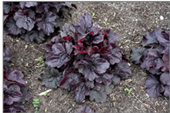
Northern Exposure Black Coral Bells