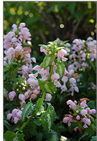
Shell Pink Spotted Dead Nettle flowers