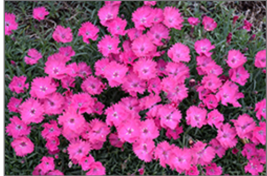
Vivid Bright Light Pinks flowers

Vivid Bright Light Pinks is recommended for the following landscape applications;