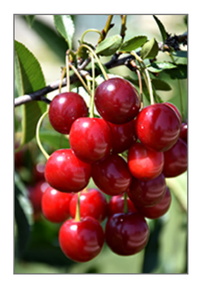
Sweet Cherry Pie Cherry fruit

6050 NORTHERN BLVD, MUTTONTOWN, NY 11732 516-922-1026 WWW.HERITAGEFARMANDGARDEN.COM