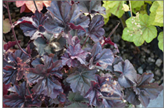
Obsidian Coral Bells foliage