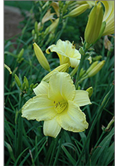
Happy Ever Appster Happy Returns Daylily flowers

Happy Ever Appster Happy Returns Daylily is recommended for the following landscape applications;