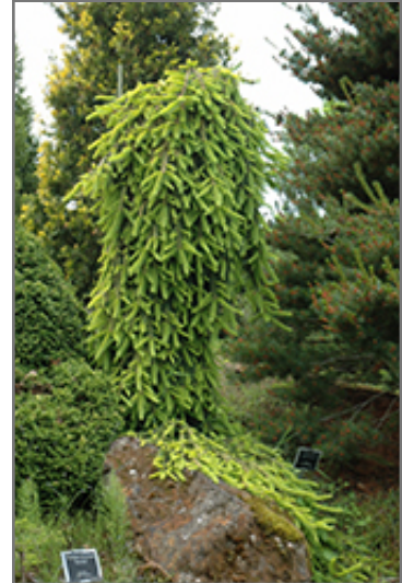
Gold Drift Norway Spruce