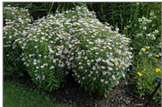
Blue Star Japanese Aster in bloom